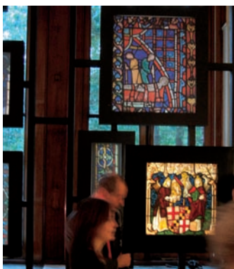
Prototype showing one object backlit