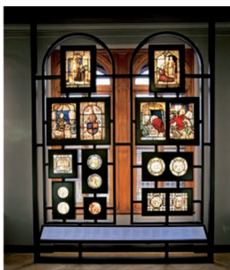
The completed screen

various objectives. The scrim is a vital part of the application, providing not only the reflective backdrop against which the light is cast, but also minimising shadow lines while allowing daylight to pass through to the stained glass. Angela von Barnholt explains: "The scrim performs a specific task of diffusion during the day when the artificial lights are off, but then it becomes the reflector once the lights are activated. Visit during a summer afternoon and the pieces are solely lit by daylight. The LEDs then take over for the evenings and gloomy winter days."