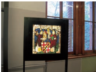
1:1 Mock-up showing LED Backlighting ON