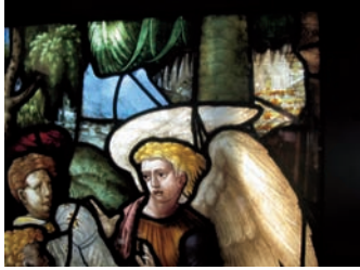
Shadows dissipated with scrim applied