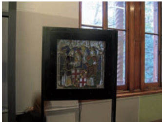
1:1 Mock-up showing LED Backlighting OFF